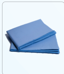
Disposable Draw Sheet (Non-woven fabric)