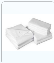
Baby Wrap Towel (White Spun Bond)