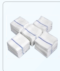
Disposable O.T. Sponge (Mop) (Cotton with X-ray Thread)

Exclusive Range : C-arm Cover, Fluoroscope Cover, PCNL Drape, Angiography Drape