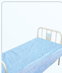
Disposable Bed Sheet (PVC/PE Material)