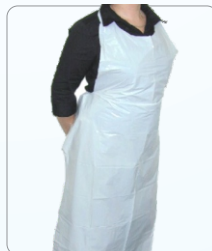
Half Gown (PE Polythene)