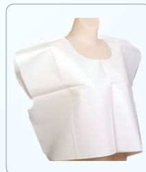
Dental Apron (Laminated White Spun Bond)